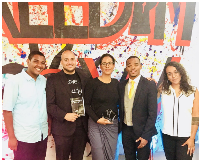
Recipients of the 2018 Freedom Now Award