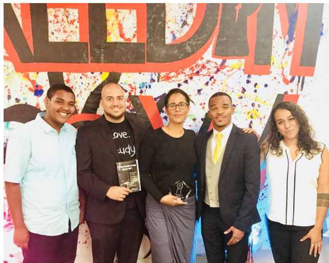
Recipients of the 2018 Freedom Now Award