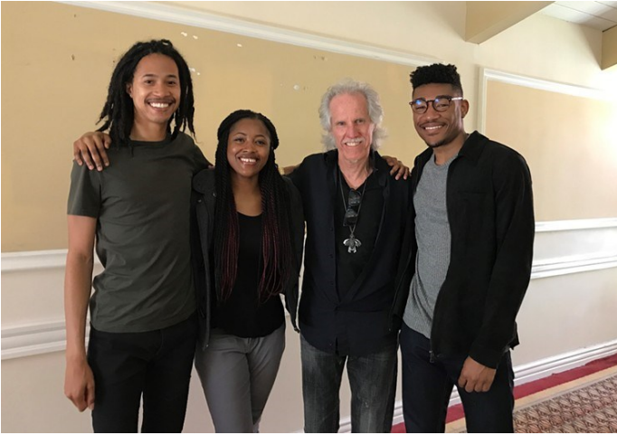
John Densmore and scholarship recipients.